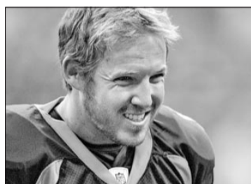
Broncos kicker Matt Prater

With all things equal in the kicking game (New Orleans' Martin Gramatica and Denver's Matt Prater are perfect through two games), this could come down to coverage of kicks and punts. Denver has allowed several big returns, including a 103-yard kickoff return for a score last week. And Bush took a punt back 55 yards for a score last week. Edge: New Orleans